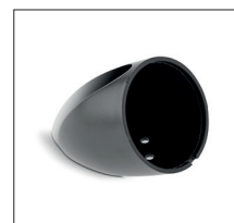
Tilted mounting frame: Easy to install