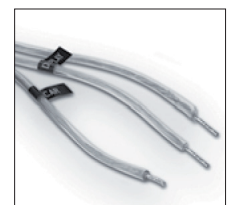
Mounting options: car and display