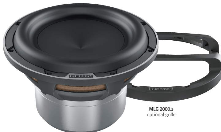
MLG 2000.3 optional grille